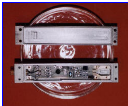
A prototype of a Semiconductor Superconducting Quantum Interference Device (SQUID)

... Squid is the acronym for superconducting quantum interference device , and it measures magnetic flux or field extremely accurately at ultra-low levels, such as the level reached when a group of neurons in the brain is triggered. The device is made of a ring of superconducting material, usually niobium metal, a few millimeters wide, with a slice of insulator, a few atoms thick, sandwiched into the loop. When an electric current is applied to this superconductor, the flowing current generates a magnetic field around the wire loop. Inside the superconducting loop this magnetic field is extremely sensitive to any changes in magnetism. If a change in magnetic field is detected, the current flow in the Squid changes to re-adjust the field strength to counter the external force.